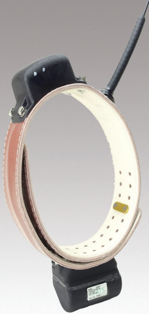
Model G5-D ~500 g, 4 yr life

World's Most Reliable Transmitters and Tracking Systems